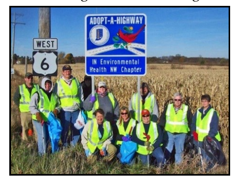
(continued on page 5)

IEHA chapter Members are civicminded. Two examples include the Northwest Chapter's ongoing participation in the state's Adopt a Highway program. Several times yearly, Members clean up a mile-long section of the high-